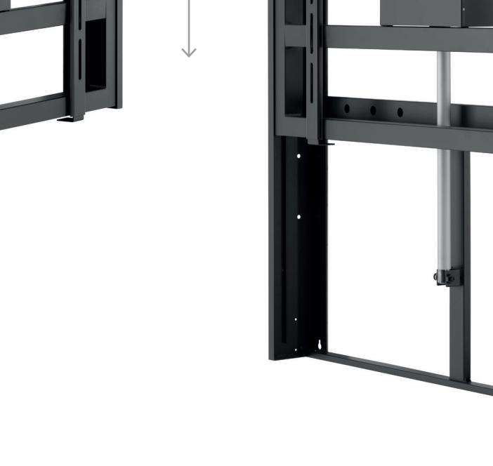
wired touch control

Technical changes reserved | This document is the property of HAGOR Products GmbH. Forwarding and duplication of this document, utilization and communication of its contents are not permitted unless expressly permitted. A violation obliges you to pay compensation. All rights reserved in the event of a patent, utility model or design registration.